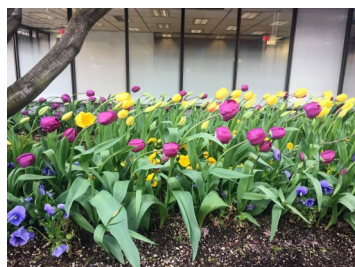
Der Frühling in Oregon!