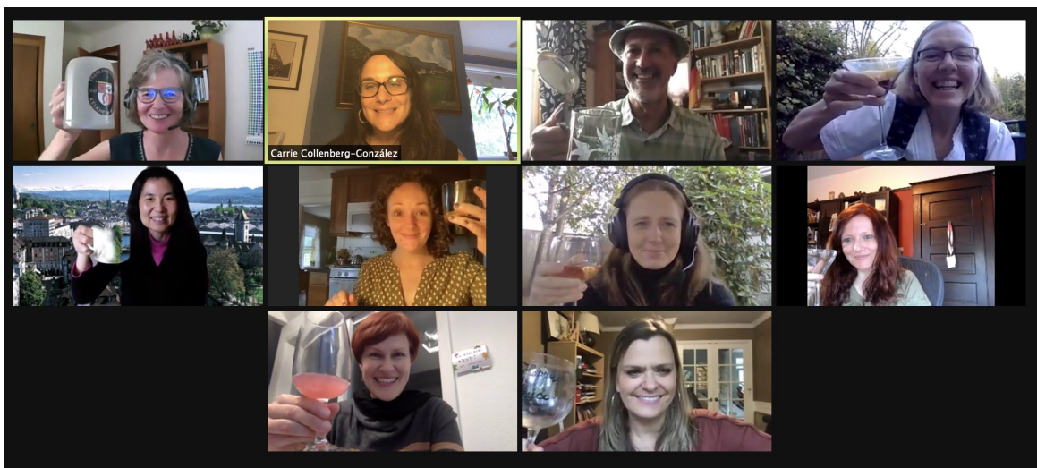
OATG Oktober Zoomfest